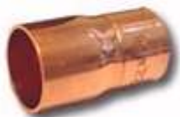
FIGURA DESCRIPCIÓN CÓDIGO MEDIDA BOLSA PRECIO EUROS